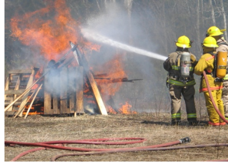
Local Firefighter training session